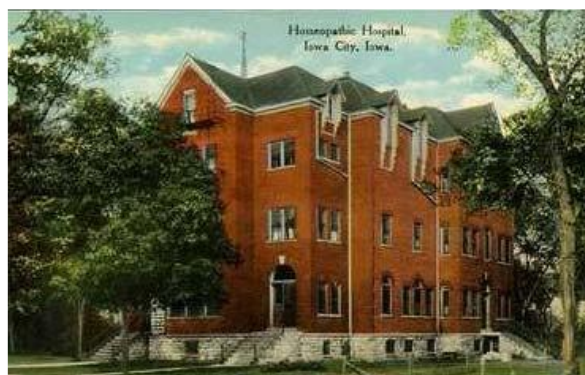
Homeopathic Hospital, Iowa City, Iowa.