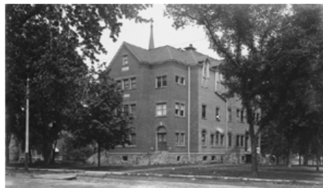
Homeopathic Medical Hospital, Summer

Program awarded $1600 to erect a building between Jefferson and Iowa Streets.