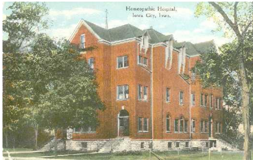
Homeopathic Hospital, Iowa City, Iowa.