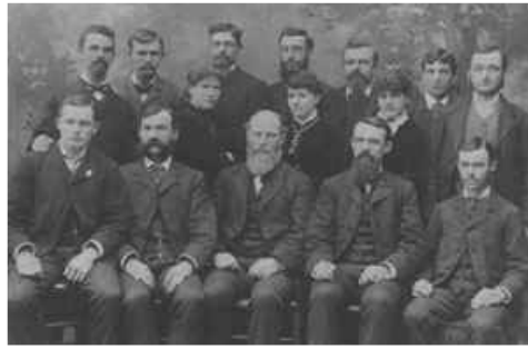
60. UI Homeopathy Class of 1882