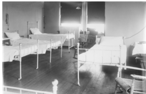
Old Homeopathic Hospital Interior, ward view

1887 - 2nd request for hospital filed; denied. Rented space for hospital.