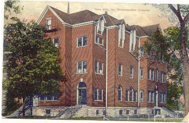
Homeopathic Hospital, Iowa City, Iowa.