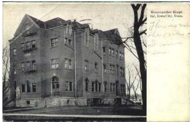
Homeopathic Hospital, Iowa City, Iowa.

No more courses in homeopathy taught in the U.S.