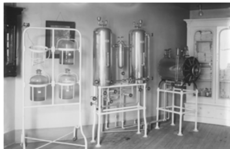
Old Homeopathic Hospital Interior