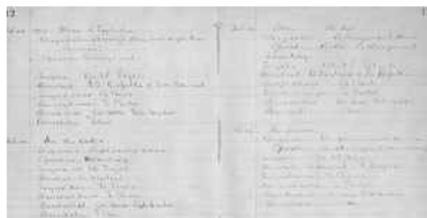
64. Pages from Medical Homeopathic Case Record