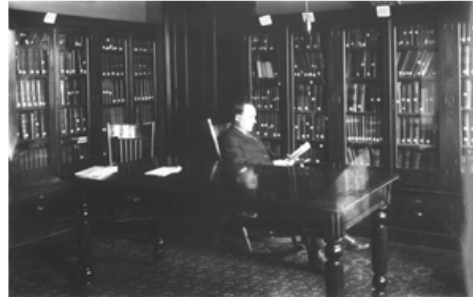
Old Homeopathic Hospital Interior (1911)