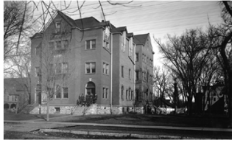
Homeopathic Hospital, trees bare

1929 - UI Homeopathic Hospital building went down in flames.